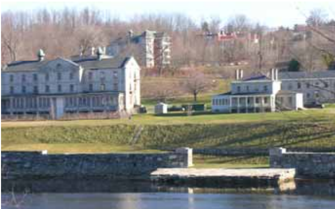
Arsenal Complex. Site improvements to the bank, stone wall and boat landing were possible through funding from the Save America's Treasures grant program, which was matched with a $90,000 contribution from CRID.

Additionally, efforts are underway to rehabilitate the historic Colonial Theater as a performing arts facility.