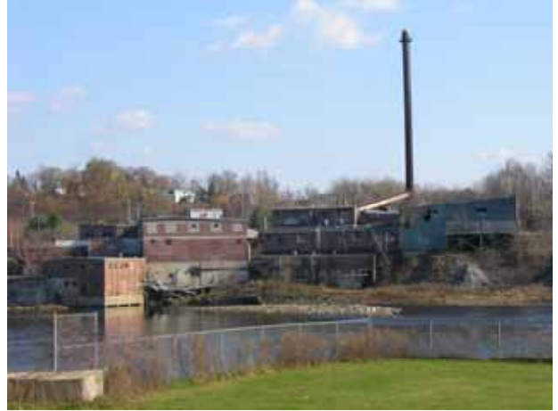
Statler Mill, across from Mill Park

conjunction with the Maine Department of Environmental Protection. A recent fire at the site increased safety concerns, and ultimately the mill may have to be demolished. CRID hopes to assist the city of Augusta and state of Maine in determining the best option for the site.