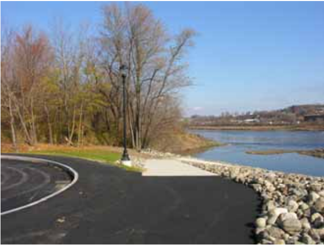
New Kennebec River boat launch entrance

In addition to infrastructure improvements, the Mill Park is being used for events and festivals. In 2006, the Spring Running, an annual event commemorating the return of fish passage to the Kennebec River, was held at the Mill Park site. Future events include the 2007 Native American Veterans Pow-Wow.