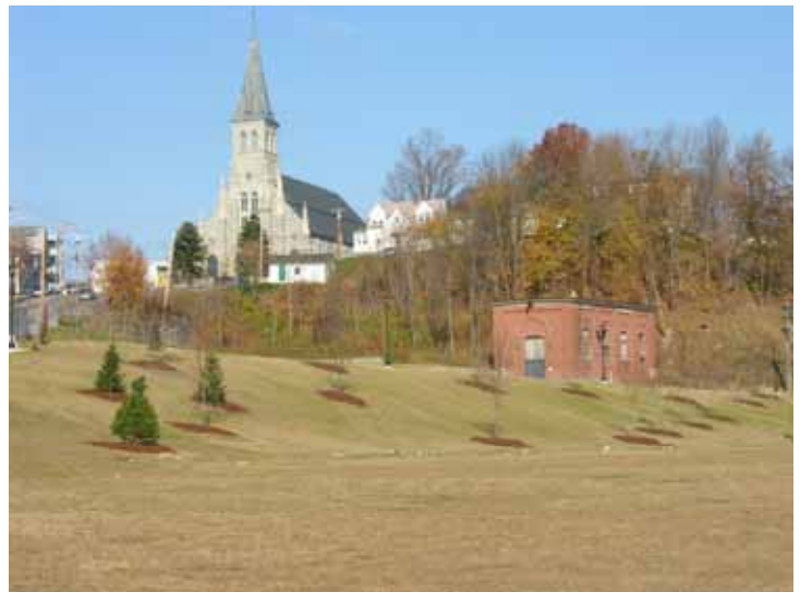
Mill Park landscaping improvements

In 2003, CRID developed a Master Plan for the park, which included a number of amenities including access to the river, an amphitheater, increased parking, cultural and historic interpretive elements, and the renovation of the old sawmill, the only remaining building on the property. Because of the projected scope and cost of the project, it was deemed necessary to proceed in phases.