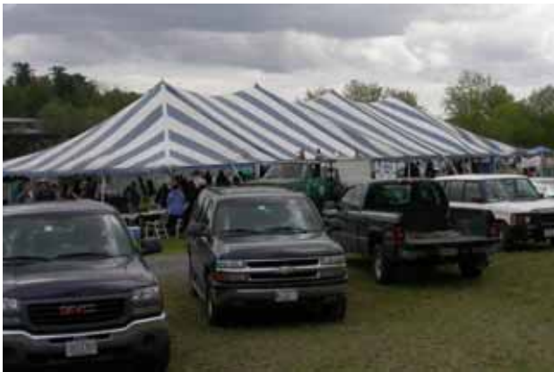
Spring Running

In addition to infrastructure improvements, the Mill Park is being used for events and festivals. In 2006, the Spring Running, an annual event commemorating the return of fish passage to the Kennebec River, was held at the Mill Park site. Future events include the 2007 Native American Veterans Pow-Wow.