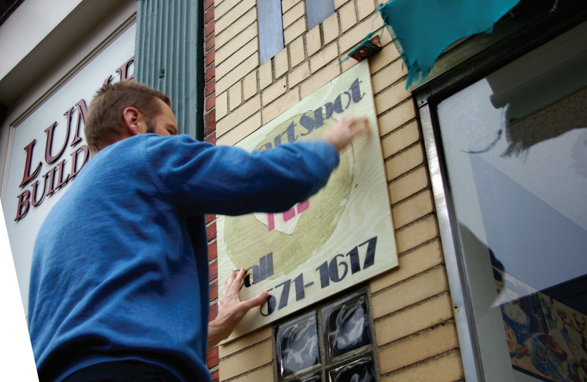
PUTTING UP A "HEART SPOT" SIGN IN BIDDEFORD, MAINE.

GALESBURG, ILLINOIS RESIDENTS WERE ASKED TO JOT DOWN FREE THINGS TO DO IN THE TOWN AND FILLED THIS BLACKBOARD WITH IDEAS.