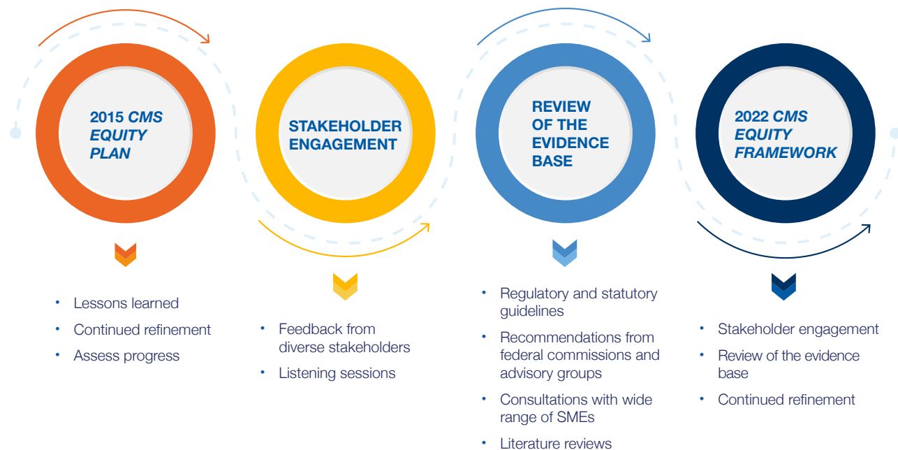
FIGURE 1: CMS FRAMEWORK FOR HEALTH EQUITY DEVELOPMENT AND EVOLUTION

Figure 1 illustrates our process to establish the CMS Framework for Health Equity . It begins with the 2015 CMS Equity Plan for Improving Quality in Medicare and carries the plan forward through continuous stakeholder engagement, review of the evidence base, and into the updated CMS Framework for Health Equity we are now initiating.