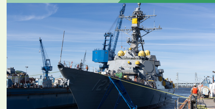
Photo credit: The Jackson Laboratory General Dynamics / Bath Iron Works